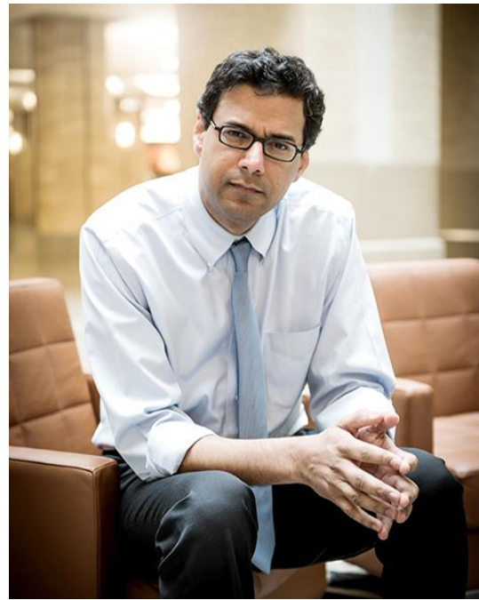
Dr. Atul Gawande