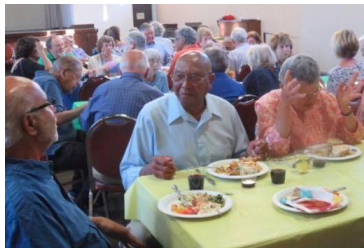
April 30 potluck

NOV Headquarters First Congregational Church 27th at Harrison