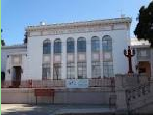
Downtown Oakland Senior Center

Gathering at the NOV office, they received picker-upper tools and big plastic