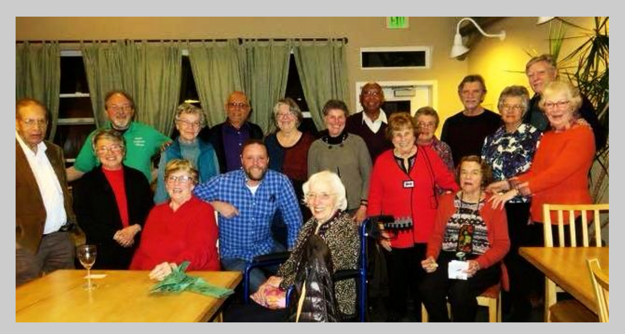
Our well-fed, happy volunteers