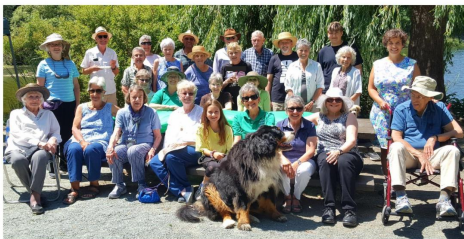
North Oakland Village Intergenerational Picnic at Lake Temescal August 11, 2019