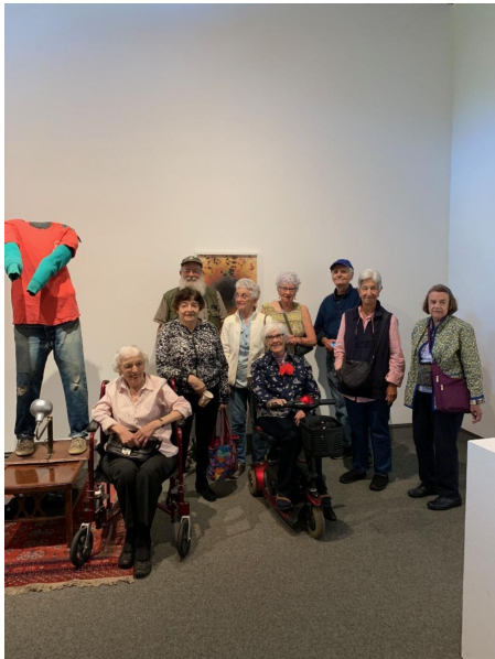
Outing at Saint Mary's College Museum