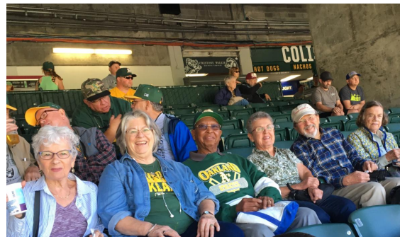
Take me out to the Ball Game - A's outing

"Make your interests gradually wider and more impersonal, until bit by bit the walls of the ego recede, and your life becomes increasingly merged in the universal life. An individual human existence should be like a river — small at first, narrowly contained within its banks, and rushing passionately past rocks and over waterfalls. Gradually the river grows wider, the banks recede, the waters flow more quietly, and in the end, without any visible break, they become merged in the sea, and painlessly lose their individual being." — Bertrand Russell