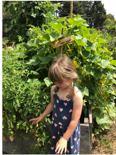
Future NOV Member at our community garden