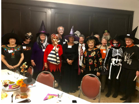
The whole gang