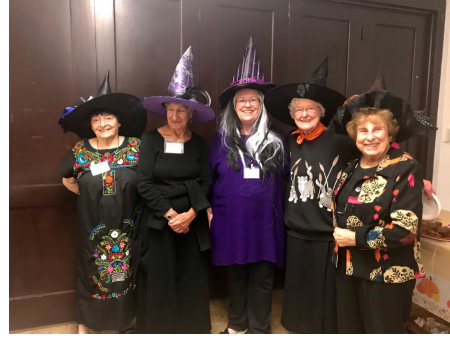
All the Witches

"Nobody grows old merely by living a number of years. We grow old by deserting our ideals. Years may wrinkle the skin, but to give up enthusiasm wrinkles the soul." Samuel Ullman